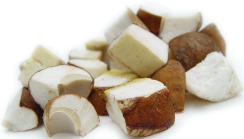
Frozen Porcini - cubes