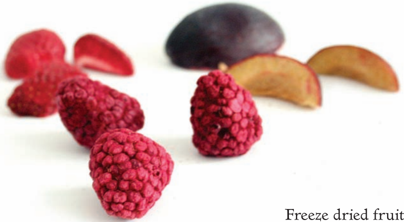
Freeze dried fruits

Use as fresh fruit or incorporate into your favorite recipe. Suitable for teas as well as cereals.