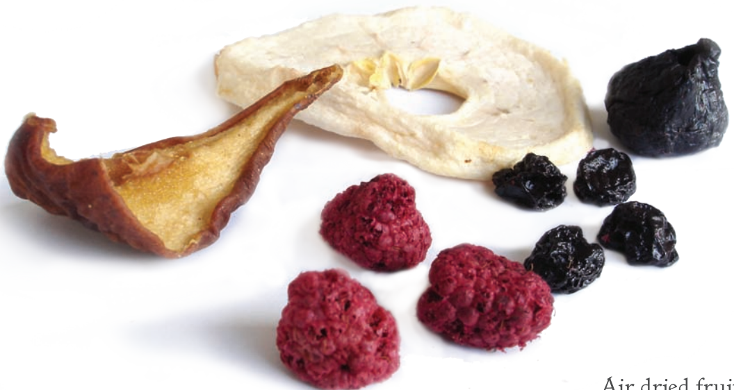
Air dried fruits