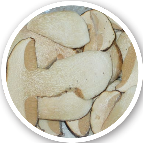
Frozen Porcini Laminate