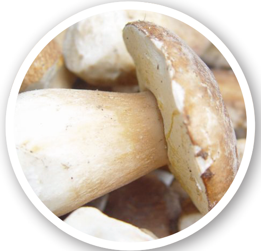
Frozen Porcini Piccolo

Piccolo and laminate are used for top culinary creations. Then beside aroma, the shape allows certain creativity of chefs